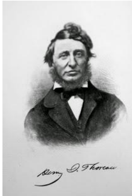
Henry David Thoreau

spending those two+ years at Walden Pond, in Concord, Massachusetts, saw America with astonishingly clear eyes.