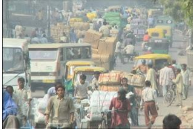
Old Delhi, India

On the other hand, one could "put on a happy face" and embrace everything that remains that is fine, and good and elegant and harmonious and compassionate, and let those guises be our guide.