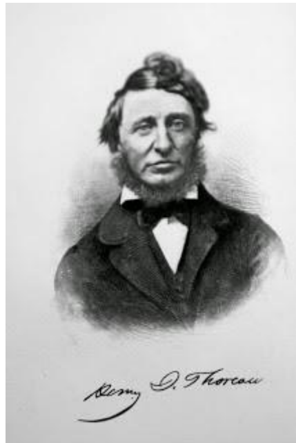
Henry David Thoreau

spending those two+ years at Walden Pond, in Concord, Massachusetts, saw America with astonishingly clear eyes.