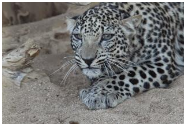
Critically Endangered Arabian Leopard

It's called, of course, the Anthropocene. We've known about it for decades, despite huge biological gap analyses. We're losing species at a rate that goes well beyond our comprehension. Out of the possible 100 million or so species, if one includes all lifeforms, we may well be losing thousands of species every day. More than half of all life is headed toward extinction - we know that, particularly all large vertebrates (those animals over 100 kilograms) are threatened. Herbivores like mountain gorillas and rhinos, elephants, giraffes, are particularly in trouble. But so are all charismatic carnivores, like tigers, wolves and grizzly bears. Among reptiles and amphibians, and the parrot groups of birds, the crisis is overwhelming. And this doesn't begin to factor in overall loss of habitat, key nurseries of the planet, like the neo-tropics and coral reefs.