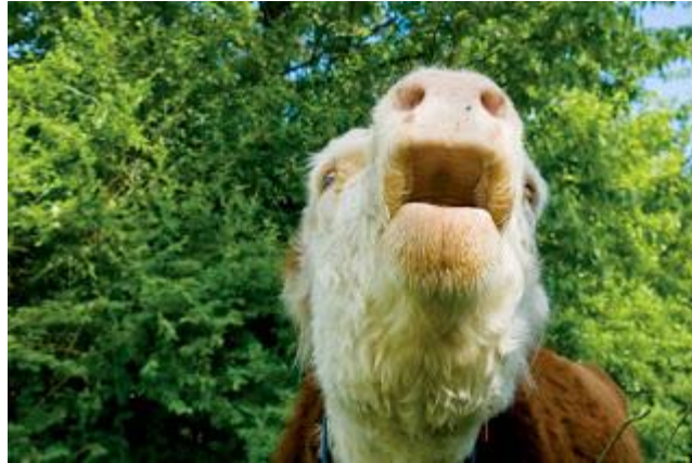
A Bovine singing

Despite the fact so many philosophical adages remind us that those who ignore history are doomed to repeat it, genocides and ecocides that call upon the human conscience to demand, as in the case of the Holocaust, "Never Again," "We will never forget," the unbelievable truth is that violence continues. Perhaps violence that cannot be compared with Auschwitz and the many other "camps" - a more grotesque and unimaginable saga of evil in modern history than words can possibly hope to describe. Indeed, never has a cluster of nations ever plunged willingly into such depravity. But a terrible evil, nevertheless, namely, our slaughter of other animals, populations, and habitat.