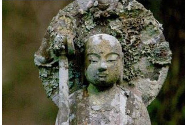
In A Moss Garden, Kyoto Greenbelt, Japan

In nation after nation, there are similar contradictory situations, as with Bhutan, from Suriname, or Denmark, to "clean green" New Zealand, to little San Marino or Andorra . Wherever there are people, there is human nature, which translates into some level of conflict. Yet, in those aforementioned six countries are spectacular examples of ecological governance from which the rest of all nations can take away some valuable lessons, whether in the realm of family planning, animal and habitat protections, or the distributions of goods and services and social welfare nets at various levels.