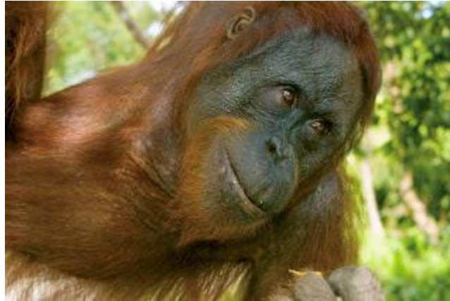
Orangutan, Borneo

what Marxist ideology also came to recognize with respect to the imbalanced ownership - ownership of any kind - of private property and the ravages of materialism. I would recommend John Bellamy Foster's Marx's Ecology, Materialism, and Nature (2000), among many other works that have sought to pry open the dysfunctional ties between human need and human greed, as recorded in the ideologies of the last 175 years or so. Gandhi, Thoreau, so many in their path, have attempted to make sense, at their moments in time, of the complex and too frequent grievous crises all around them that pivoted upon the fundamental lack of fairness between most people, not to mention people and other species.