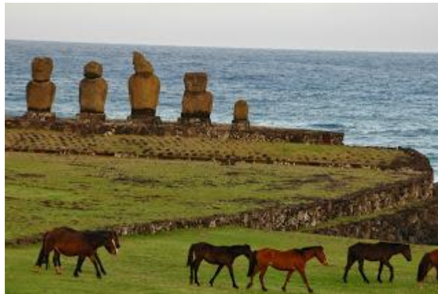
On Rapa Nui (Easter Island), Chile

fact of how the Japanese have always come together as communities during times of great crisis and mass sorrow (e.g., Fukushima). We see it in the current natural disasters in Nepal and Vanuatu. But for the two civilizations that we know have gone extinct during several millennia, vast deforestation (Rapa Nui), rampant drought (Mesa Verde, Canyon de Chelley), Black Plagues, or a Hundred Years War, or four Crusades, the Spanish Inquisition, etc. did not seem to phase most locals across the world. It killed or didn't kill them. So I must adduce that these community revivifications in the spirit of camaraderie might be viewed as the exceptions.