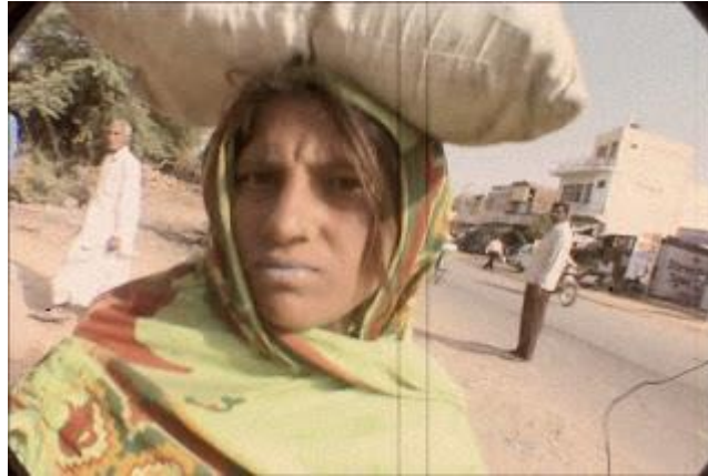
In Rajasthan, India

And finally, when push comes to shove, will this new generation of technologically advantaged young people (some two billion youths approaching their child-bearing years at present who are the lucky ones) have the courage of their convictions when it comes to the big picture - Nature - which they know is in a process of severe and rapid fragmentation and ruination?