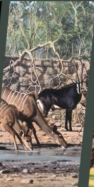
Craig Bone Water Break